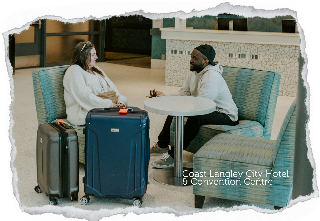
Coast Langley City Hotel & Convention Centre