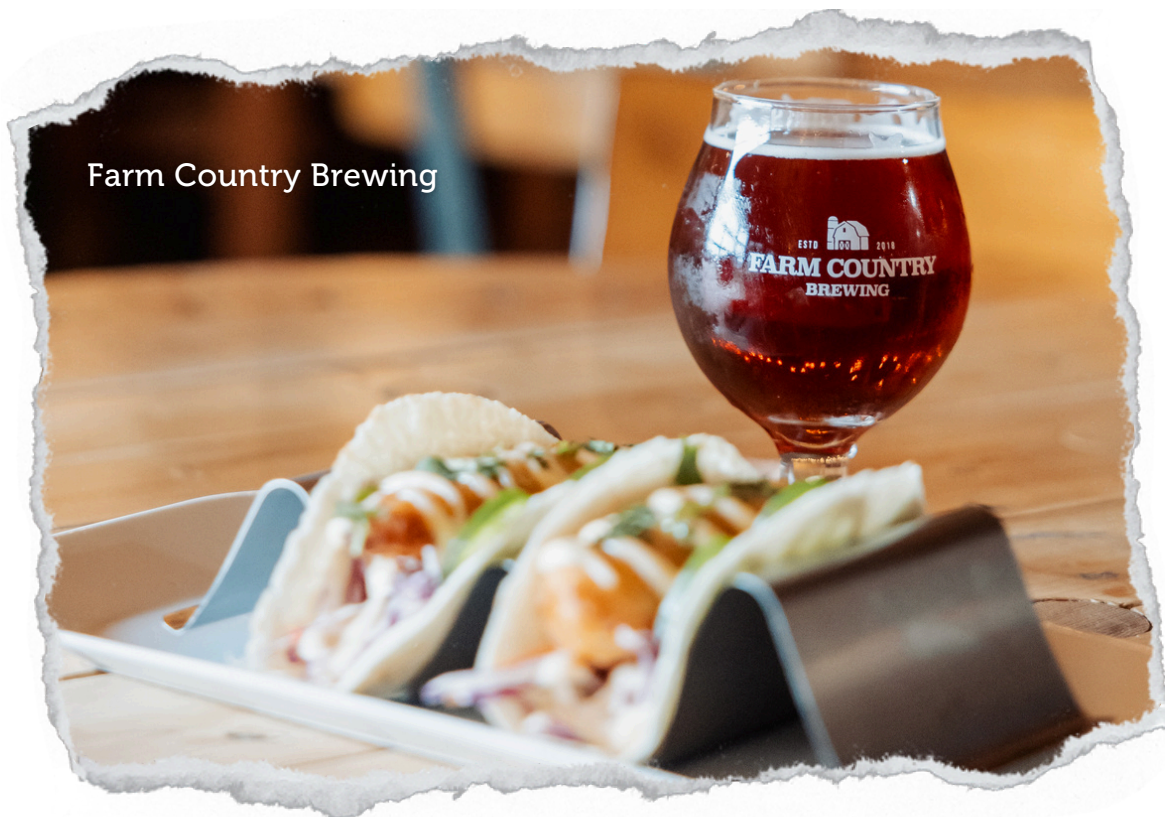
Farm Country Brewing