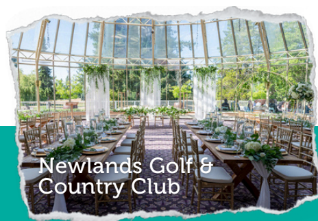
Newlands Golf & Country Club