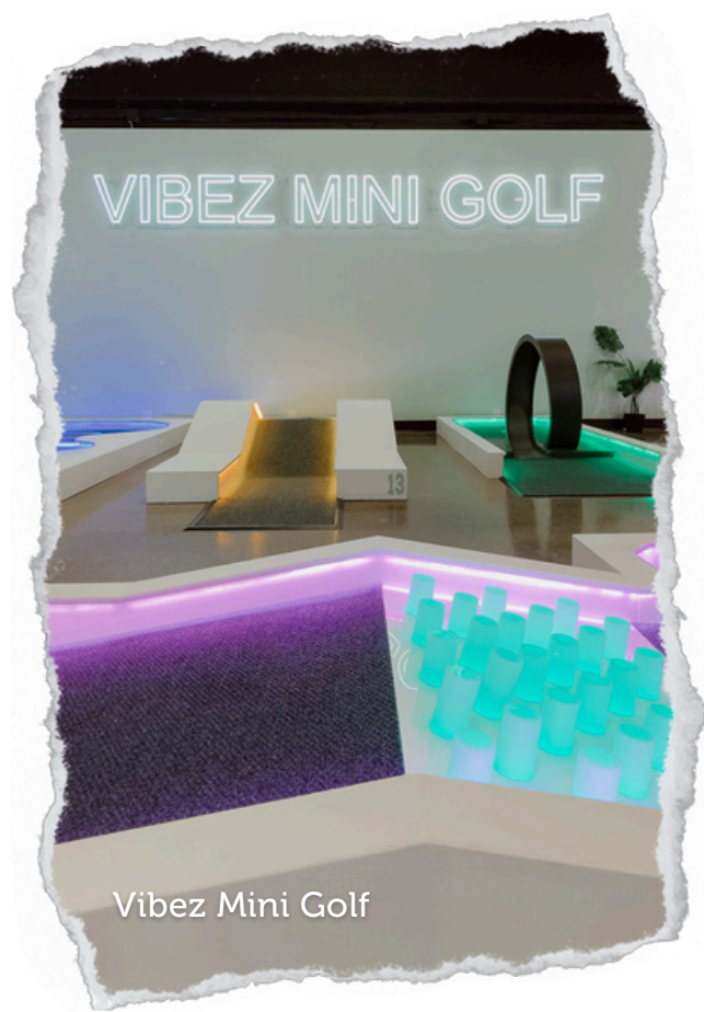
Vibez Mini Golf