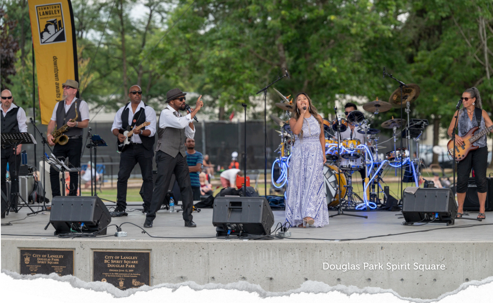
Douglas Park Spirit Square