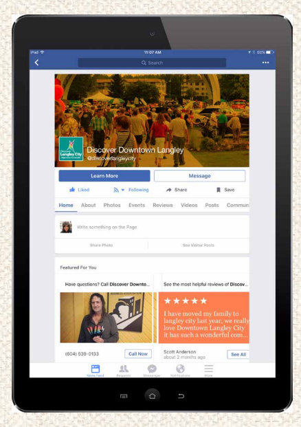
FACEBOOK Option 2