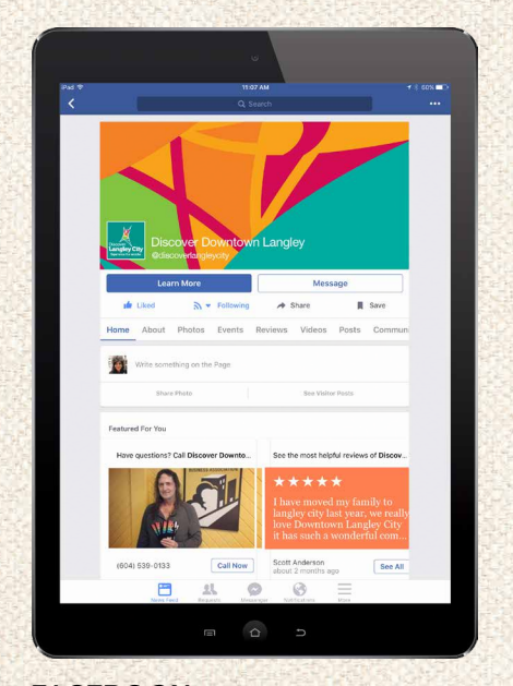
FACEBOOK Option 1