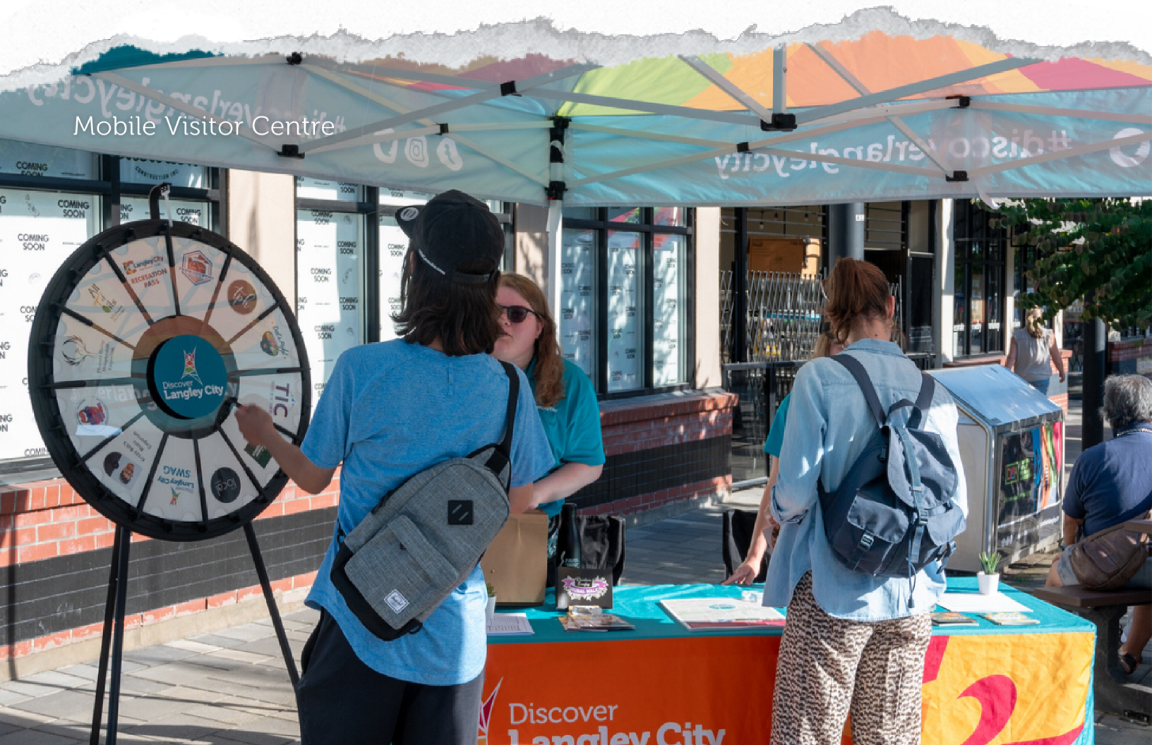
Mobile Visitor Centre

In addition, DLC is here to support the events that bring tourists to Langley City. Often this means sponsoring the events financially or attending with the mobile visitor centre. Occasionally, DLC will sponsor giveaways, in-person or online, to bring more attention to local businesses. Discover Langley City also provides its own partnership opportunities to feature local businesses throughout the year.